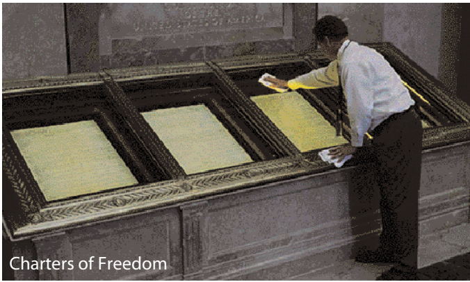
Charters of Freedom

In a special security glazing application, Starphire glass was used to protect the Charters of Freedom, including the Declaration of Independence, U.S. Constitution and Bill of Rights. Starphire glass was selected because of its ability to maintain the highest clarity and true-color fidelity, even through great thicknesses and lamination. "You can hardly tell the glass is there," noted the Project Manager responsible for the display restoration at the National Archives. Some of the same features make Starphire glass ideal for a wide range of applications.