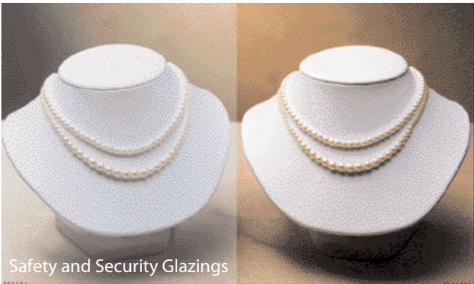
Safety and Security Glazings