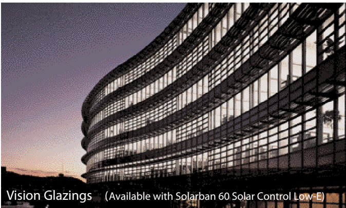
Vision Glazings (Available with Solarban 60 Solar Control Low-E)