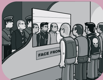
Police identification line-up