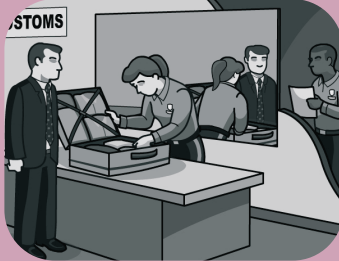
Airport Security monitoring