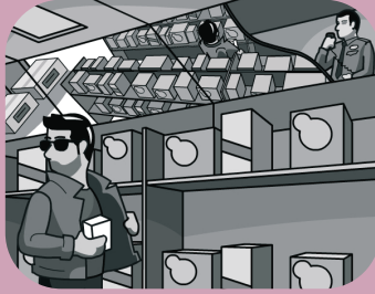
Supermarket security monitoring