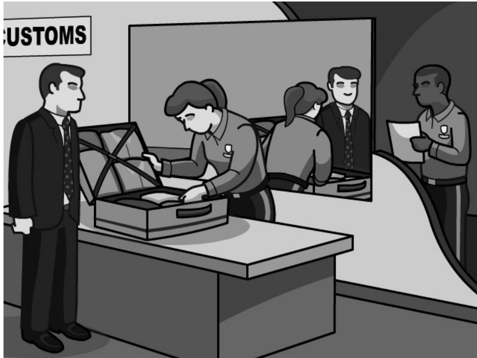
5.1 Airport Security. Baggage Inspection