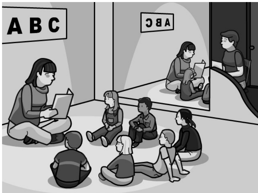
5.2 Day Care Center