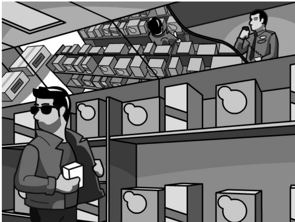
5.4 Retail Store Anti-Theft Monitoring