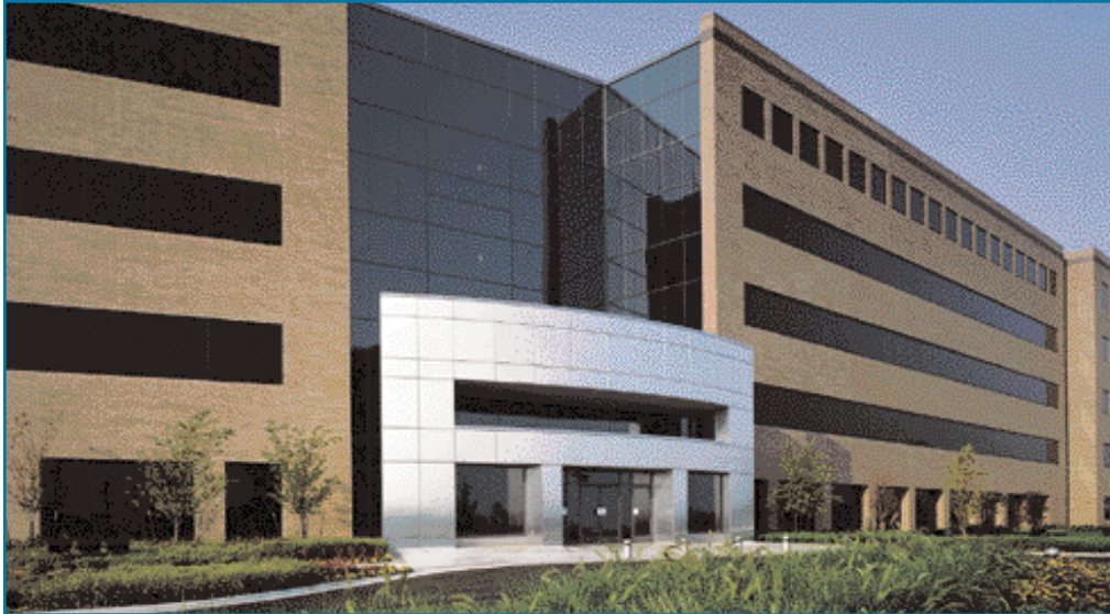
Beverly Headquarters Location: Fort Smith, AZ Products: Graylite® & Optigray® Glasses/Solarban® 60 Glass Architect: Cromwell Architects Engineers Glass Fabricator: Oldcastle Glass

From warm grays to bold blacks, PPG High-Performance Gray glasses are a critical part of the architect's decorative repertoire. PPG offers two proven favorites that deliver good looks, together with exceptional UV protection and excellent solar control characteristics.