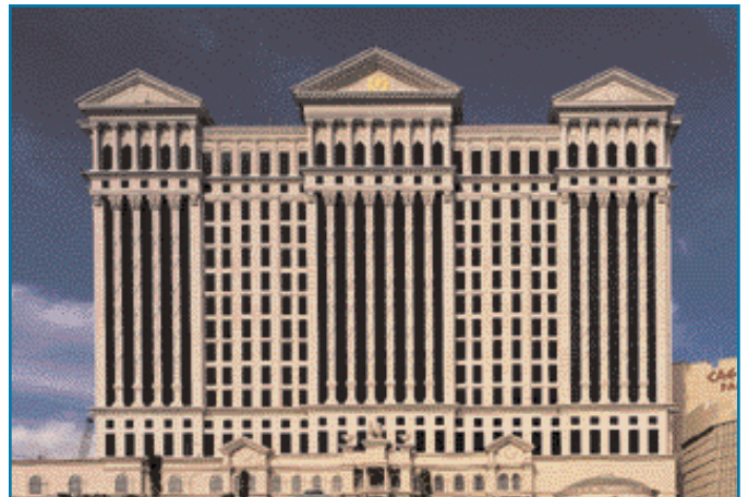
Caesars Palace Tower Location: Las Vegas, NV Product: Graylite® Glass Architect: Bergman Walls Youngblood Glazing Contractor: Accuracy Glass Glass Fabricator: Oldcastle Glass

In a one-inch insulating unit, Graylite glass has a Solar Heat Gain Coefficient of 0.34, which is also among the